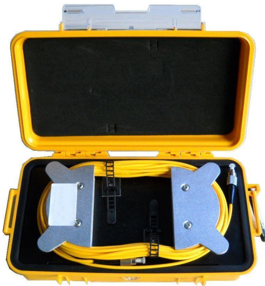
Big Box (0.5km, 2km]

Designed to aid in the testing of fiber optic cable when using an OTDR. The OTDR Launch Fiber box is used with Optical Time Domain Reflectometers (OTDR's) to help minimize the effects of the OTDR's launch pulse on measurement uncertainty. Available in many different configurations and fiber lengths.